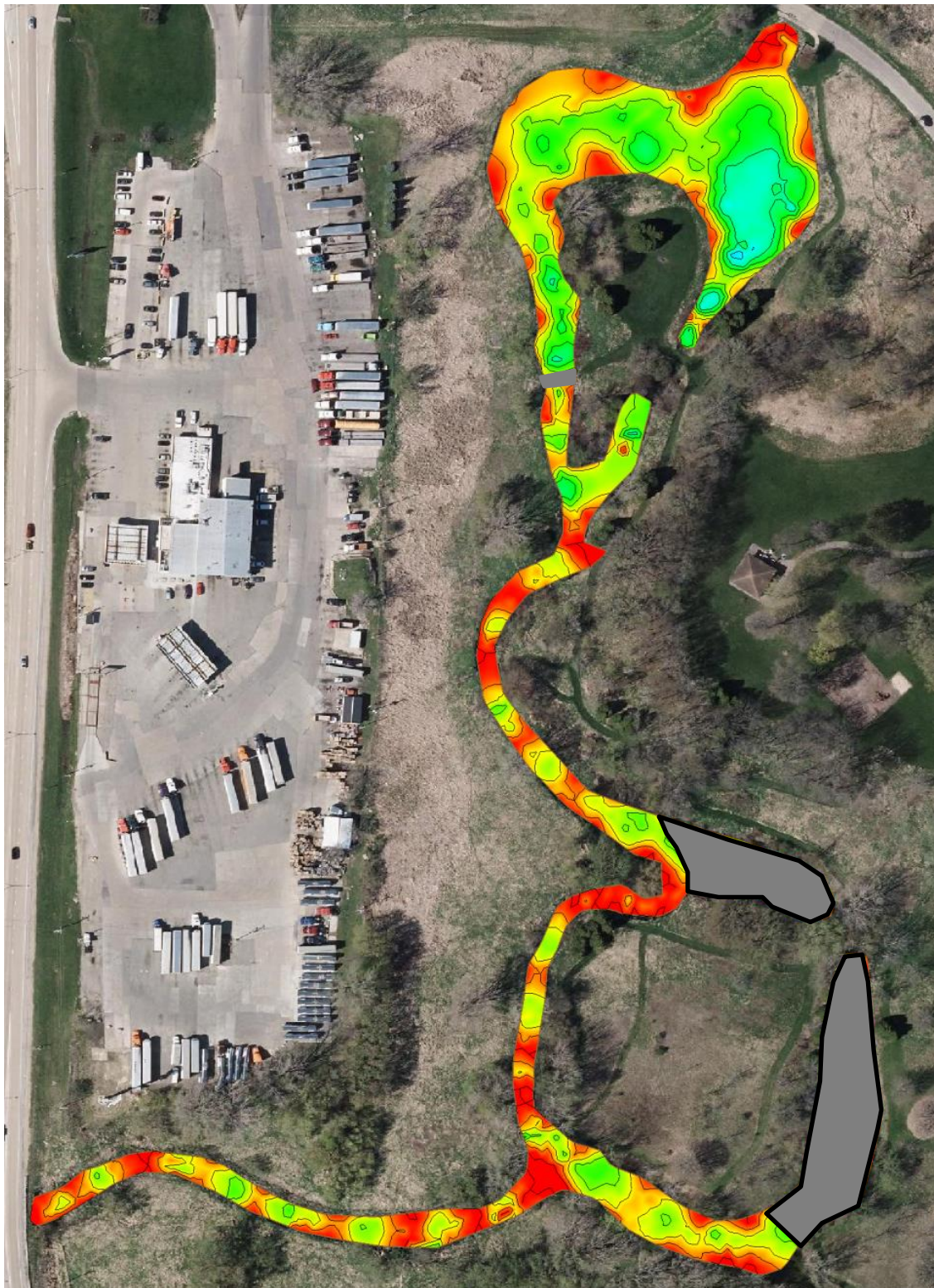
Sediment Removal Depth Map